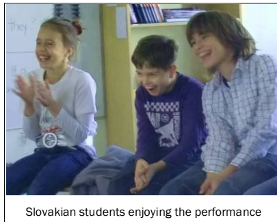
Slovakian students enjoying the performance

Through the sponsorship of individuals and churches in Germany and Austria, this October, Covenant Players was able to return to Bratislava, Slovakia! The