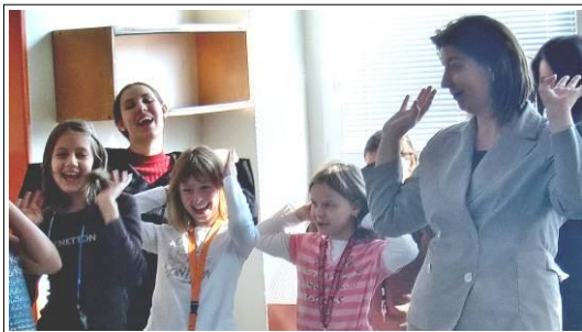
Students in Slovakia participating in the program