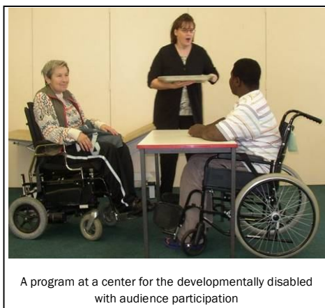
A program at a center for the developmentally disabled with audience participation

school shows with us. He is already known in the schools we went to, so it was really great. Afterwards, he handed out an invitation to a workshop and evening performance we will be having next Saturday at the church. What a brilliant link between the churches and the schools! What a wonderful way to bring the young people into the church!"