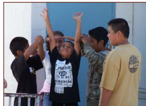
Oxnard fifth graders create living sculptures as part of CP workshop

that such change is possible and that we can make a difference. We are witnesses that an experience, an encounter, a play, a message, a parable as it were, can truly be the catalyst that brings about a change in point of view, perspective, perception—even attitude. That is cause for great hope and the beginning of life change.